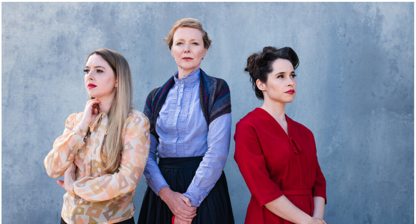
A moment of departure. A moment of return. A moment of reckoning.