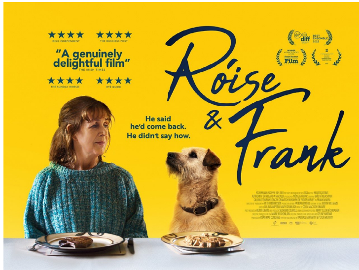
Friday, January 27, 2023 was opening night with the screening of "RÓISE & FRANK".

The opening night film at the 31 st annual Ciné Gael Montreal Film Series. This series, unlike many film festivals that last about seven to ten consecutive days, is spread out over several months. Its 2021 run was cut short by the pandemic, and its 2022 run was limited to streamed selections.