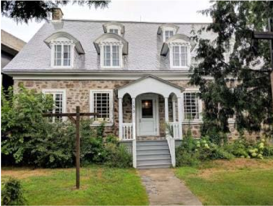
Quebec Family History Society

When doing Irish genealogical research you use a combination of free and subscription websites. The research is not as simple as putting in an Irish surname as you see in the television commercials.